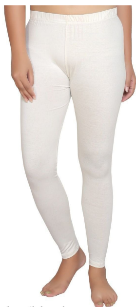
Ankle Length Leggings