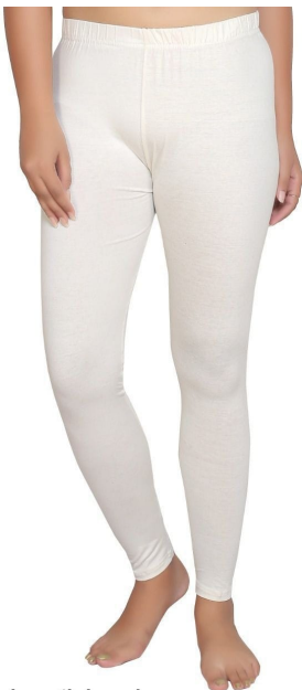
Ankle Length Leggings