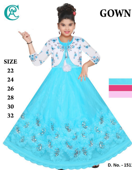
D. No. - 1511