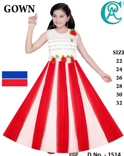
D.No. - 1514