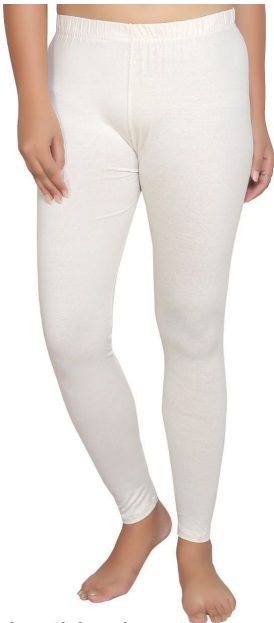
Ankle Length Leggings